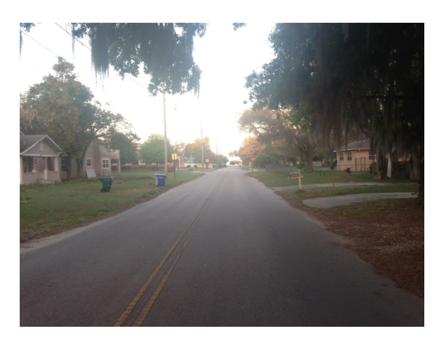
Street View - East